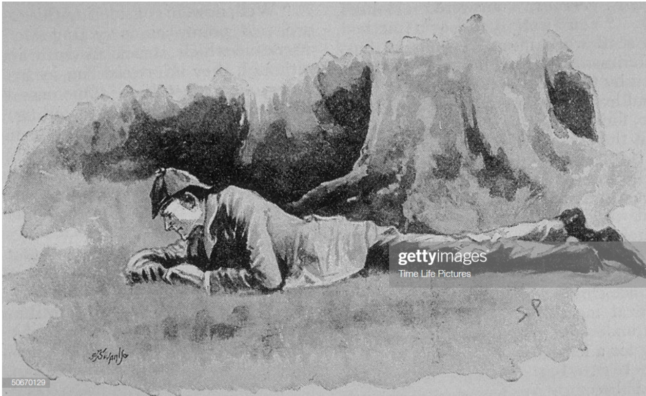
Sidney Paget – The Boscombe Valley Mystery