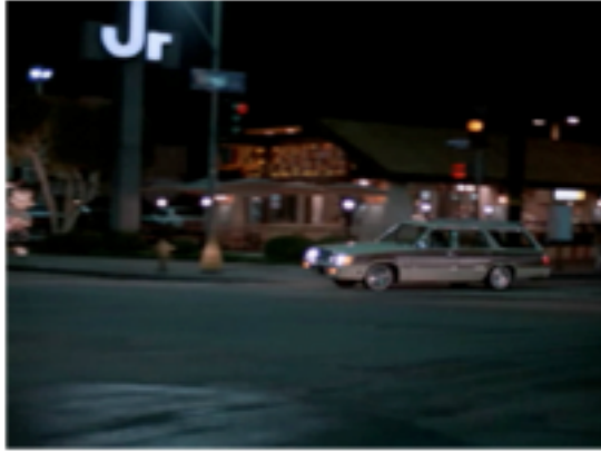
Scene from the episode "Sudden Death" in Season 1.