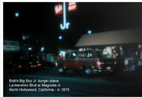
Bob's Big Boy Jr. burger place, Lankershim Blvd at Magnolia in North Hollywood, California - in 1975